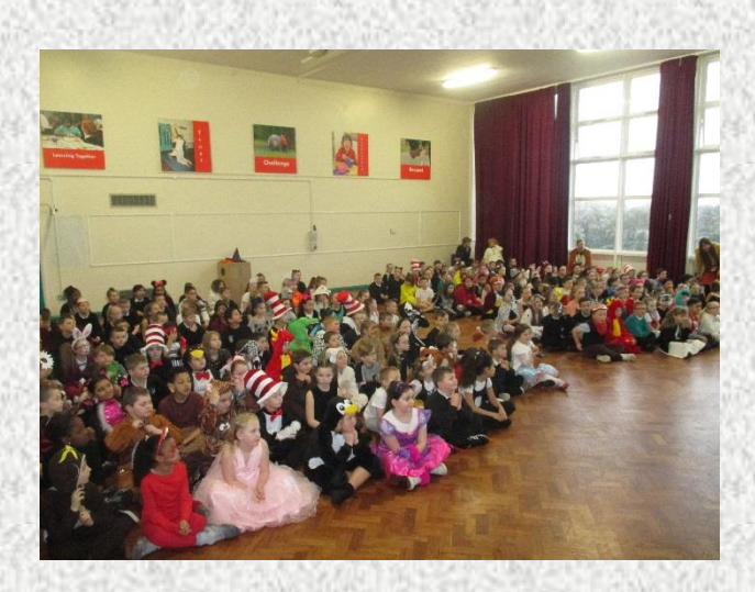
Competition time! You have two choices!!

Wooden spoon characters - Can you make your favourite book characters out of a wooden spoon?! Use the spoon part for the head and the handle for the body. See the pictures below An example of goldilocks and the three bears!